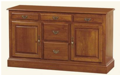
Heritage Colonial Sideboard

Floor-standing lower cabinets ordered by storage capacity: