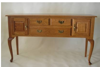
Queen Anne Huntboard

The Buffet provides a superb focal point for those whose entertaining style leans toward the casual. As a buffet table or a place to repose multiple courses, the longer buffet cabinets provide ample space for quite a spread. As with the sideboard, serving utensils and "good" flatware store handily in the shallow drawers (with optional silverware liners). Larger serving dishes and other utilitarian miscellany find their place behind the ample lower doors, where, though hidden from view, they are readily available.