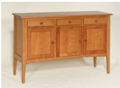
Heritage Shaker Buffet

The Sideboard is the work horse of the dining room. For the space it occupies, it provides more practical storage space than any other cabinetry piece. Serving utensils and "good" flatware store handily in the shallow drawers, which, by the way, can be provided with optional silverware liners. Larger serving dishes and other utilitarian miscellany find their place behind the ample lower doors, where, though hidden from view, they are readily available.