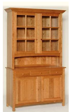
Shaker Style (right)