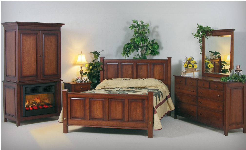
Shaker Bedroom Suite by American Heirloom Furniture