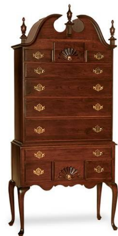
Heritage Queen Anne Highboy (Cherrywood)

one to open the lower drawers without having to bend over. It was also popular with one's staff, as it allowed them to clean under it with ease.